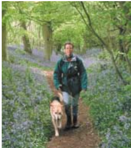
Countryside Agency / Jos Joslin

Areas of open country are often some of the most peaceful parts of the countryside and their ‘wild’ beauty is maintained by those who manage the land for a living.