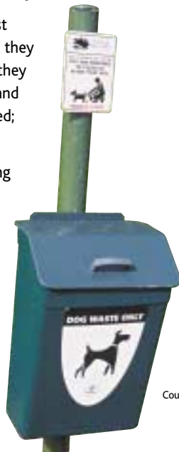
Countryside Agency / Joe Low