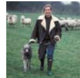
Kennel Club / C Seddon