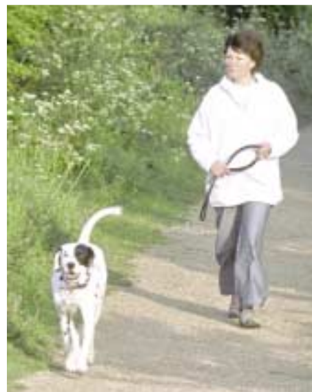
Countryside Agency / Joe Low