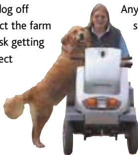
Kennel Club / Dogs for the Disabled

This can happen if farm animals have young, or have been worried by dogs in the past. If chased, it's safer to let your dog off the lead to get away and distract the farm animal away from you. Don't risk getting seriously hurt by trying to protect your dog.